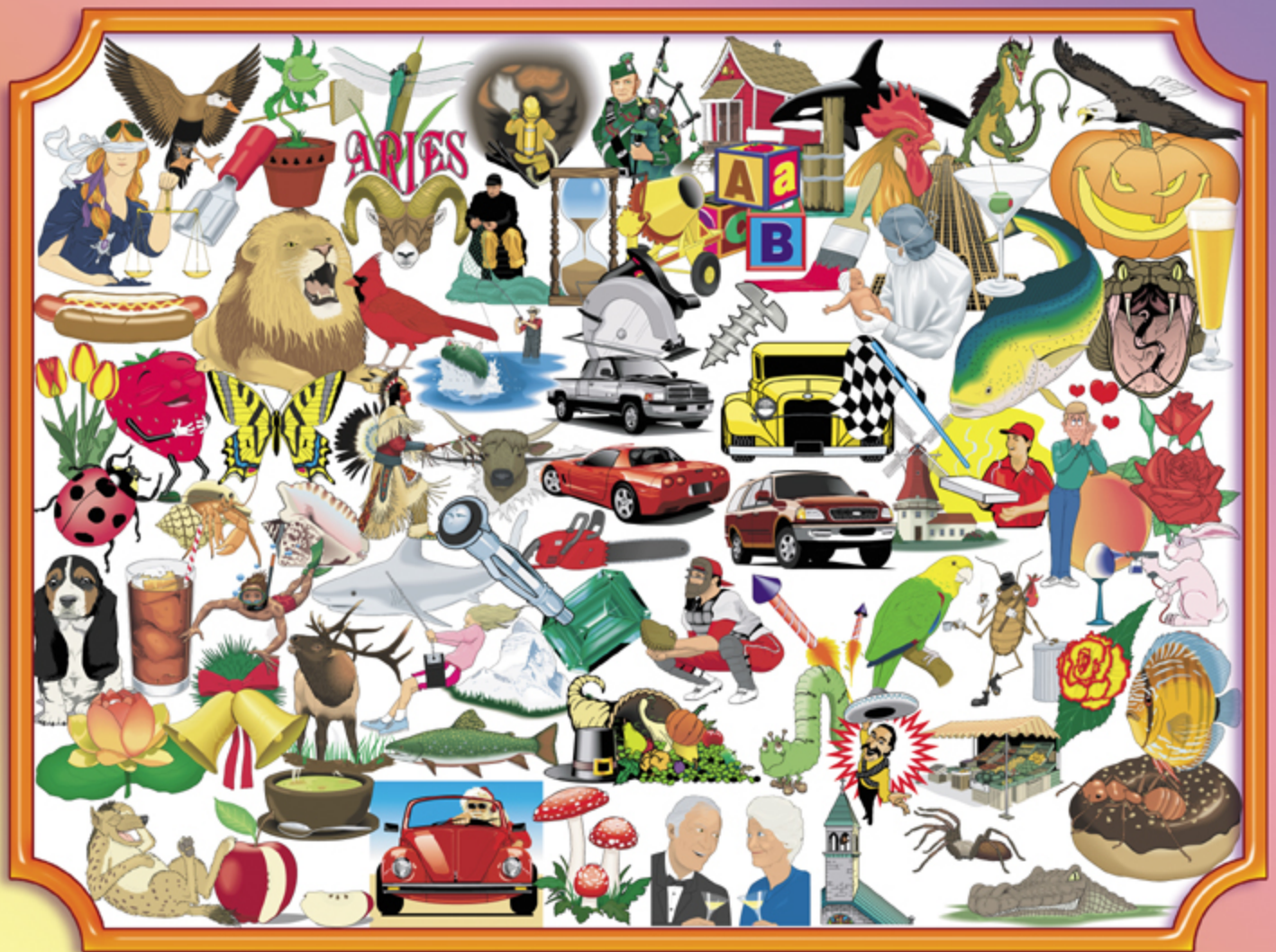
IMAGE CATALOG & USER GUIDE

High Quality Digital Artwork for Print-n-Cut Sign Making Systems 100% Vectors • Full Color • 1,600 Illustrations